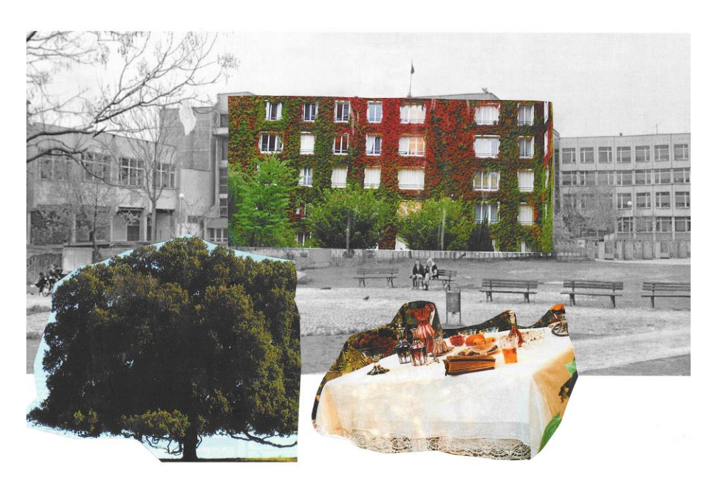
Figure 4. Collage of a dream school made by student

Making models : On the base of their observations and analysis, finally the students decided to design and create a bench in the school yard by using Euro palettes, because there were no places for sitting there. The location was chosen carefully because their bench had to be protected from sun and rain. They made a research and examined different examples of this kind of furniture. The students created a model of Euro pallet