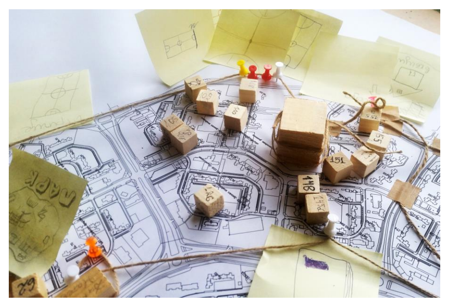
Figure 3. Model of a route of children's favourite places in the district

architectural elements. They explored different floors of the school adding lost doors, windows, columns and other missed elements on the plan (see figure 4).