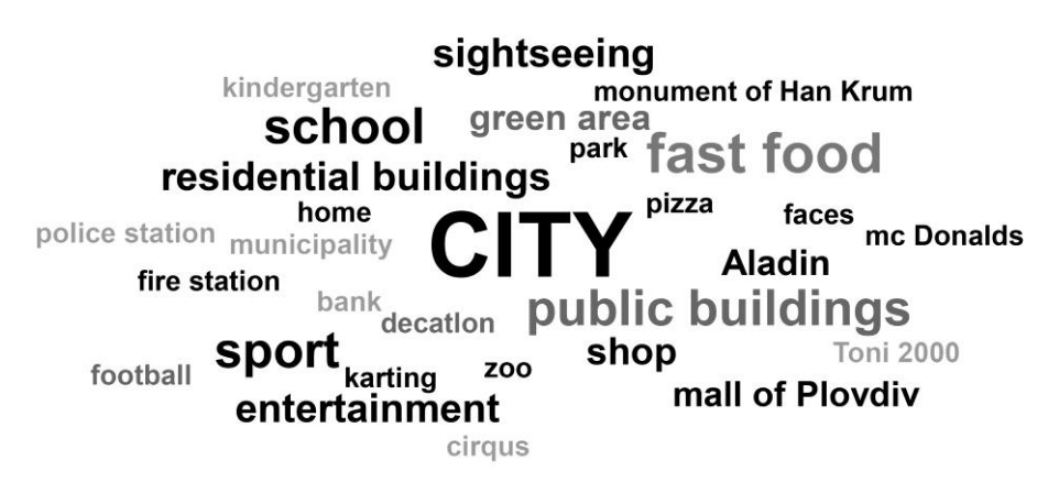
Figure 1. The students drew a mind map, giving examples from their neighbourhood

Our city: During the course the children investigated and analysed their district and school. They perceived the city as a living organism which was dependent on people's activities. The students started to distinguish the different types of buildings according to their function and tried to define possible types of human activities in them. They drew a mind map, giving examples from their neighbourhood. The children examined photos of three different cities, analysing the urban environment and discussed what kind of people live there and what is their social status. At the end they played a role game in which each student has a random role (child, retirement, driver, cyclist, a mother with a small child, builder, unemployed, etc.). Depending on their role the students put their requests for changes to the mayor and the chief architect of the city (in the role are the teacher and the architect) (see figure 1).