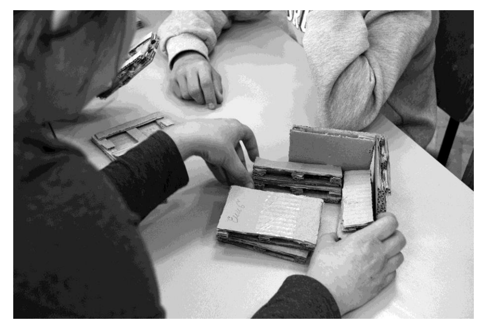
Figure 5. A model of a bench, made in 1:10 scale

from cardboard in scale 1:10 and after that tried different three-dimensional structures and compositions of individual models. They thought about the relationship between human proportions and the furnishing that they used (see figure 5).