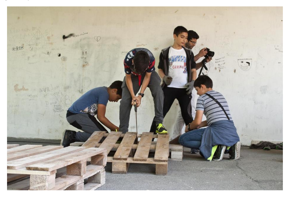
Figure 6. Students making one to one scale furniture, using EUR-pallets

One to one scale: At the end of the project the students created one to one scale furniture and vertical garden made by recycled EUR-pallets. They developed their technical skills to work with different materials and instruments like saws, grinding machine, level, screwdriver and etc. The children could observe how this bench became a favourite stop for many other students. They were feeling responsible for the place and took care for it (see figure 6).