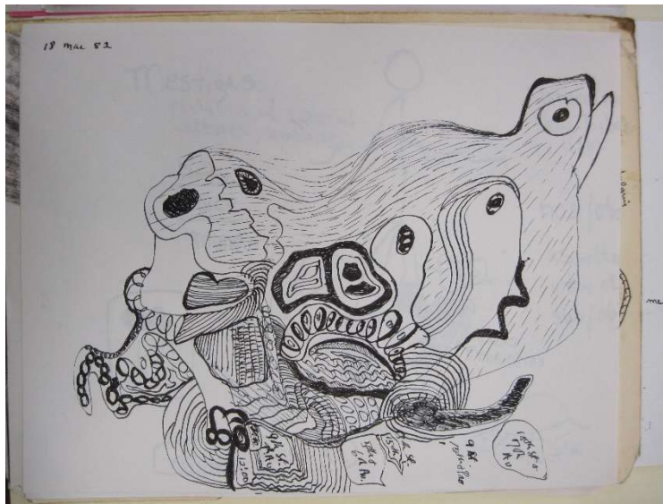
Figure 1. Gloria Anzaldúa, 18 Mai 82. Copyright © by the Gloria Anzaldúa Literary Trust. Benson Latin American Collection. University of Texas Libraries.

lips; however, this line may also indicate there are not one but two heads facing each other in profile. Moving to the right, two non-human heads rise from the center. Both heads appear to be in profile; one contains a single eye and the other has hair-like lines sprouting from its forehead and an open beak. The last head in the top-right corner resembles a frog with a bulging eye and wide-hinged mouth. Short lines cover the frog's head and formless body that expands down to the center and across to the human profile head. At the bottom of the page, Anzaldúa includes what might be scheduling notes such as times (i.e., "12:00") and locations (i.e., "18th St & 7th Av" and "5th & 6th Av").