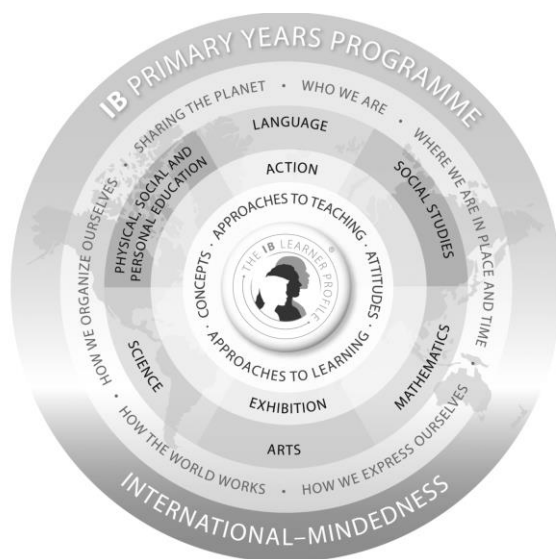
Figure 2: IBPYP Programme Model