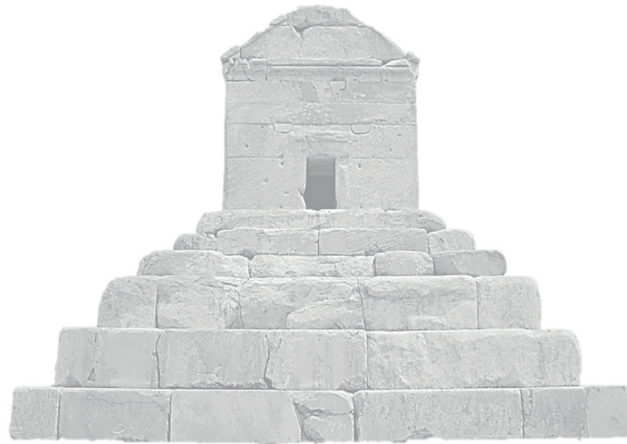
La tumba de Ciro en Pasargada. Imagen modificada a partir de una fotografía original de © Carole Raddato.