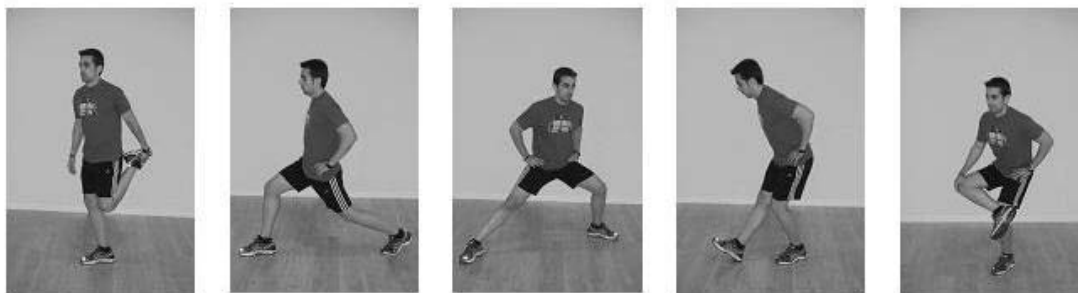
Figure 1. Active static stretching exercises

The order of exercises was randomized for each participant in order to eliminate the bias that a specific sequence could present on the results obtained. Each stretching exercise was performed a total of two separated times, keeping the stretching position for 30 seconds (2x30s) thanks to the isometric activation of movement agonist muscle, which allows an improvement in agonist-antagonist muscle coordination (White & Sahrman, 1994; Winters, Blake, Trost, Marcello-Binker, Lowe, Garber & Wainner, 2004). Both legs were stretched before performing the following exercise. A rest period between contra-lateral leg and/or a 20-s exercise was allowed. The exercise's intensity was established through the subjective and individual sensation of discomfort but not pain.