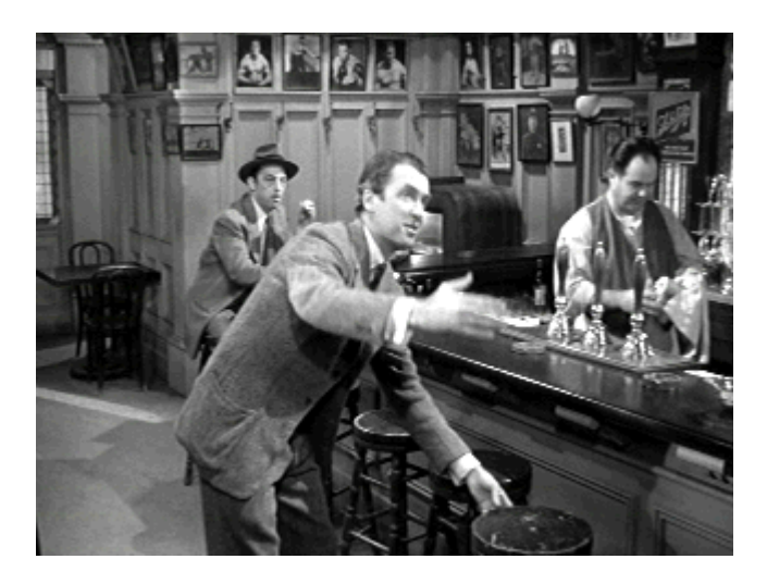
Fig. 1. Elwood P. Dowd having a real or imagined implicit discussion with Harvey.

Thus, for example, Elwood P. Dowd used to have implicit discussions with his best friend, an invisible 6' 3.5" (about 2 meters) tall rabbit named Harvey.