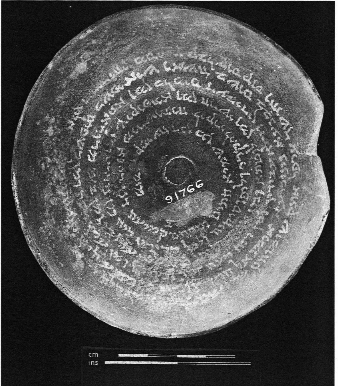
Fig. 1: Aramaic incantation bowl (B.M. 91766) from Babylon.