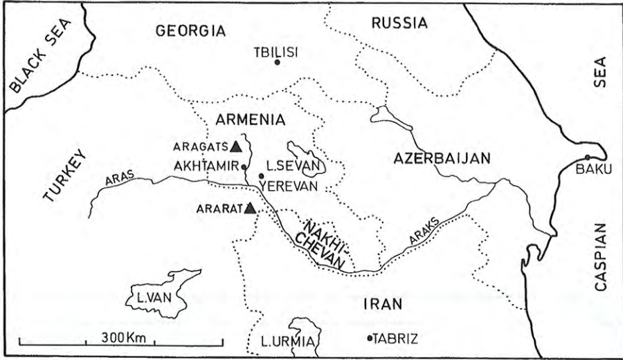
FIGURE 1 Location of Akhtamir.