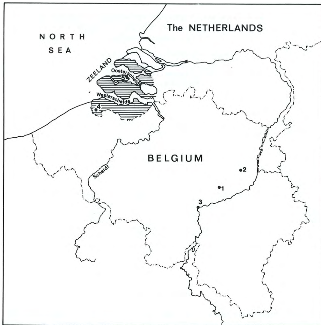
FIGURE 1. Present-day map of Belgium and the Netherlands with indication of late Roman sites mentioned in the text. 1, Braives; 2, Tongeren; 3, Namur; 4, Aardenburg; 5, Colijnsplaat.