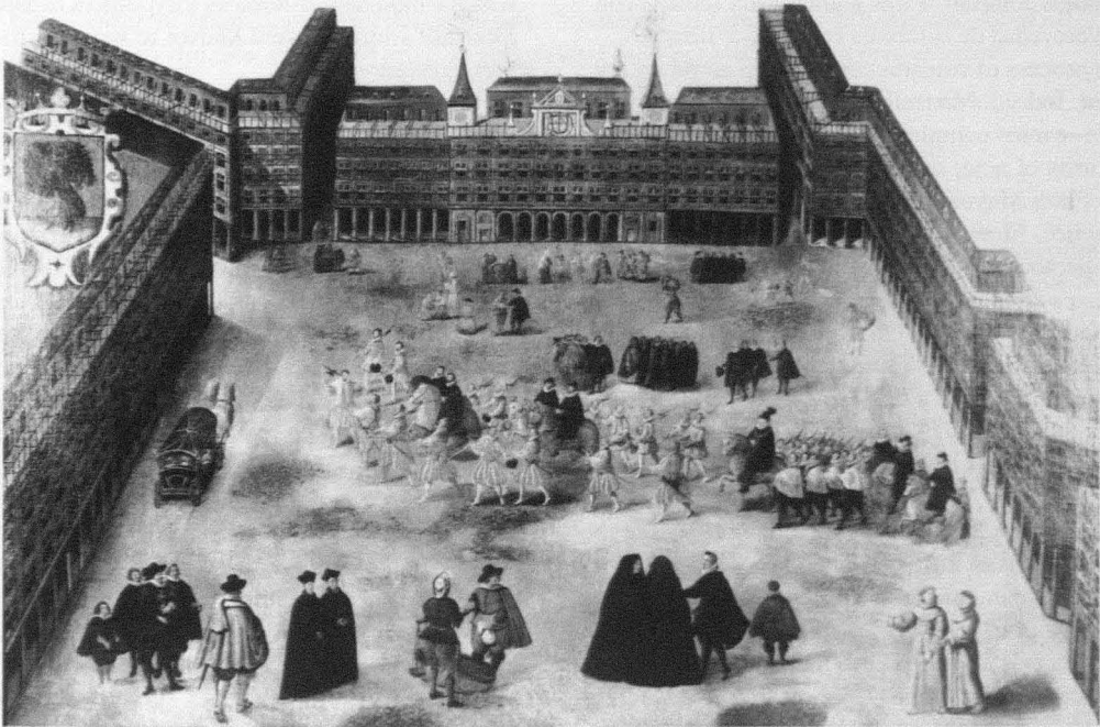
Fig. 2. Anónimo [Antonio Manzelli?], "View of the Plaza Mayor of Madrid", c. 1622. Oil on canvas. Museo Municipal de Madrid.